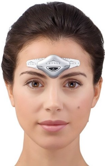
Figure 1: Cefaly Acute Device